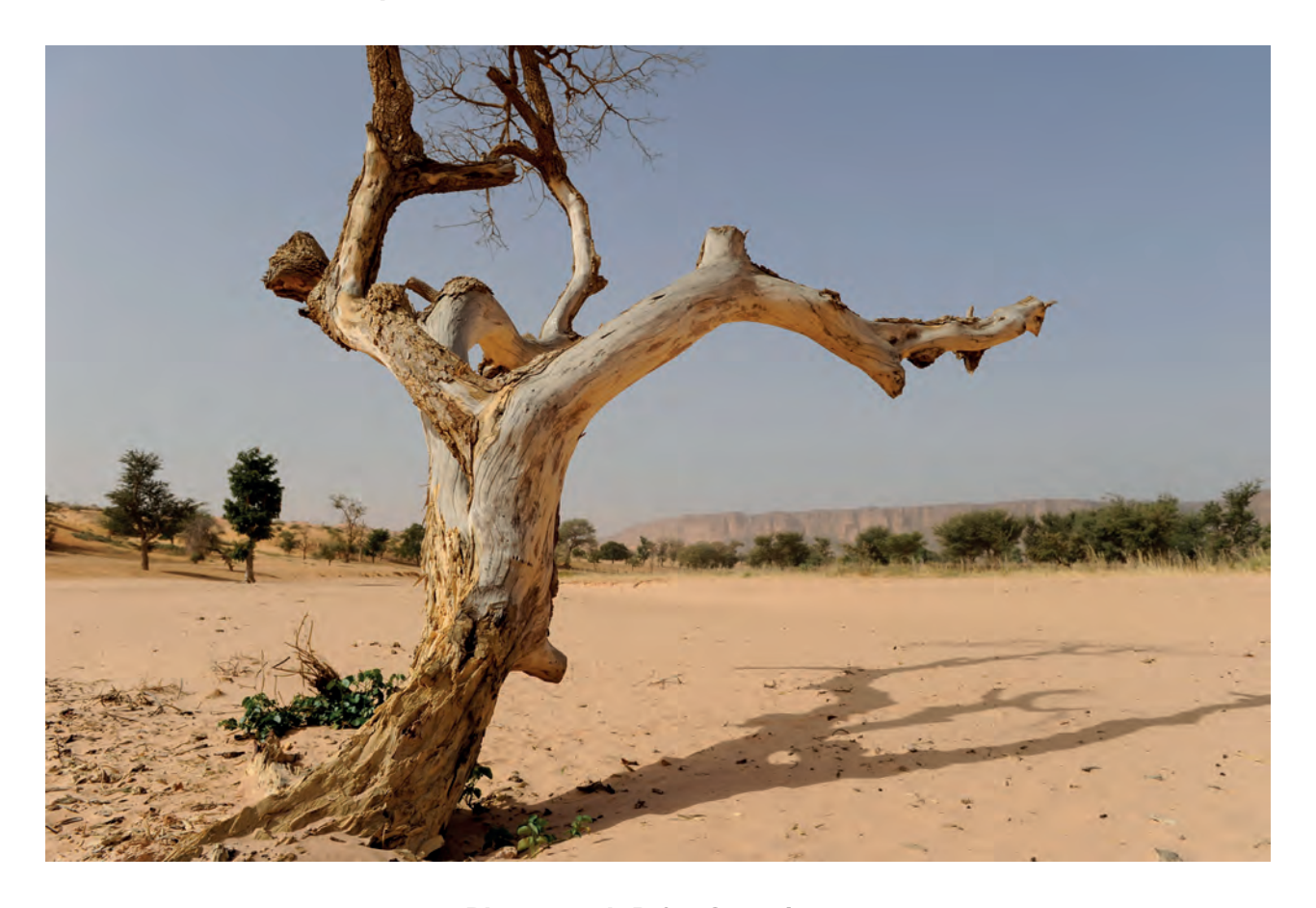
Photograph B for Question 8 Some impacts of desertification in a semi-arid environment